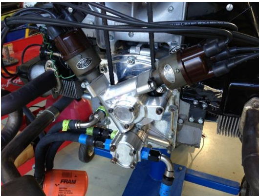
Front Cover – Machined CNC

Built on a late engine case, this special engine was featured in Excellence magazine. It was installed in an aluminum reproduction of Porsche's rare and well know Abarth Carrera. The engine features a Carrera 4 cam fan shroud, fan, and stand attached to the engine case with special welded on mounting points. The front cover is the result of hours of CNC programming and features a special drive for two original 356 distributors.