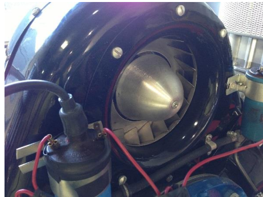
Four Cam Fan Housing and Fan