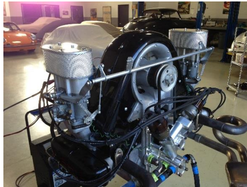
Front View of Engine

The heads are drilled for the second plug just like the original factory aircraft engines. Recently tested on a DTS engine dynamometer, it produced 120hp at 5700 rpm.